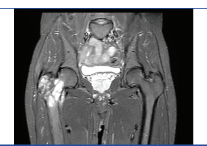
[Table/Fig-1]: MRI image showing a well-defined expansile lobulated intramedulary tumour in the upper part of right femur.

On Magnetic Resonance Imaging (MRI), a well-defined, expansile, lobulated, intramedullary T2 weighted and STIR (short T1 inversion recovery) heterogeneously hyperintense and T1 weighted isointense lesion was noted involving the metaphysis of the neck, lesser and greater trochanter of the right femur. Thinning of the overlying cortex was seen with no break. It showed post contrast diffuse enhancement with foci of blooming [Table/Fig-1]. A possibility of locally aggressive giant cell tumour of right proximal femur was proposed.